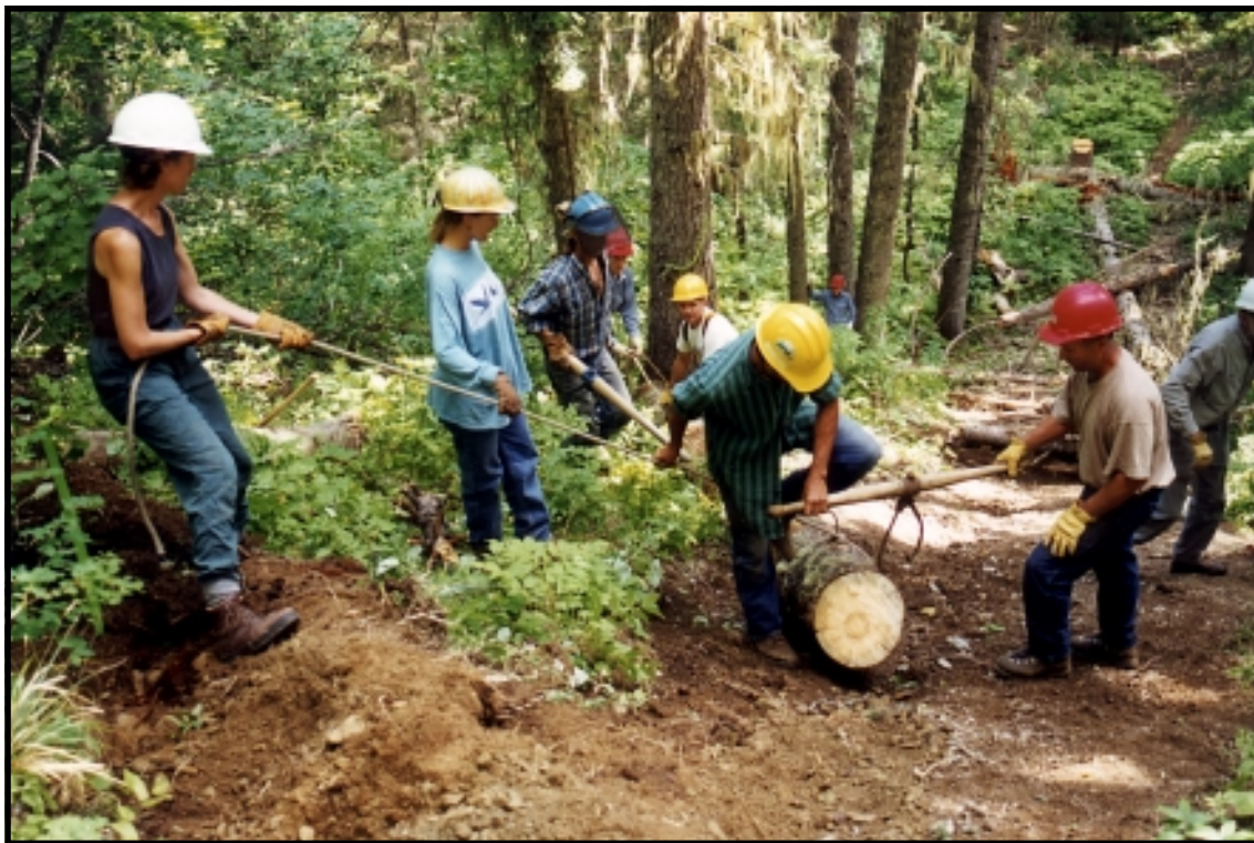
D. Blank photo

The Montana Snowmobile Association and American Council of Snowmobile As-